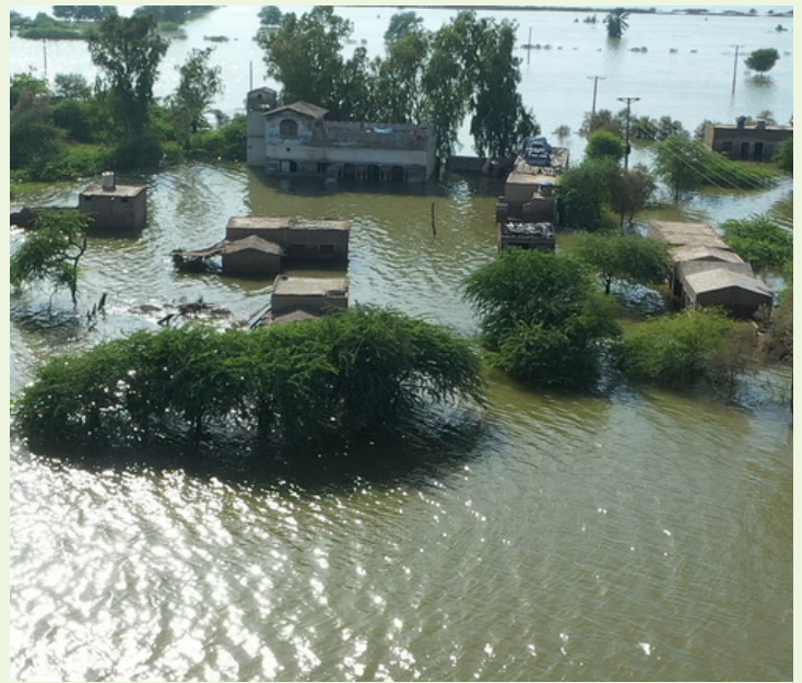
Flooding in Balochistan province, Pakistan, in September 2022. Between 10%-12% of the entire country was flooded. This is one of the costliest weather disasters in human history. Its causes are linked to man-made climate change.

In addition, each of the partner organisations has additional climate justice school resources. There is a directory of these resources at the end of this guide. Please use these resources as you wish.